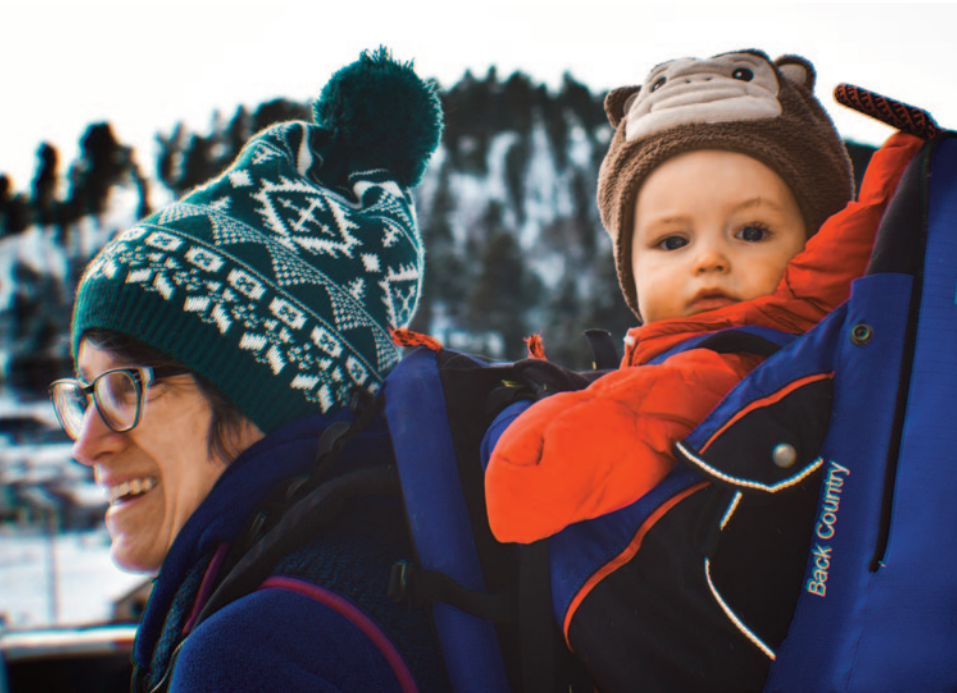
from Winterfest snowshoe hike