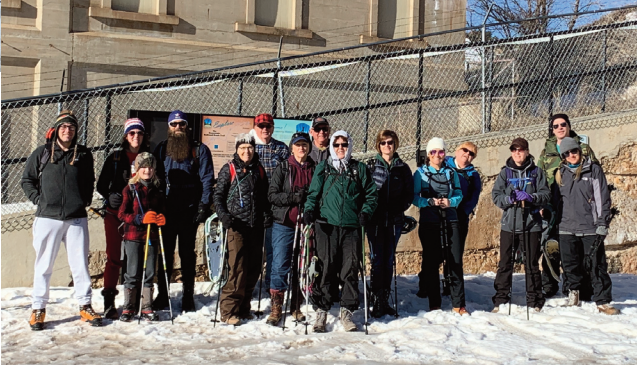
Snowmobiles @ Whitetail Creek Resort, the fireworks, snow shoe hike.