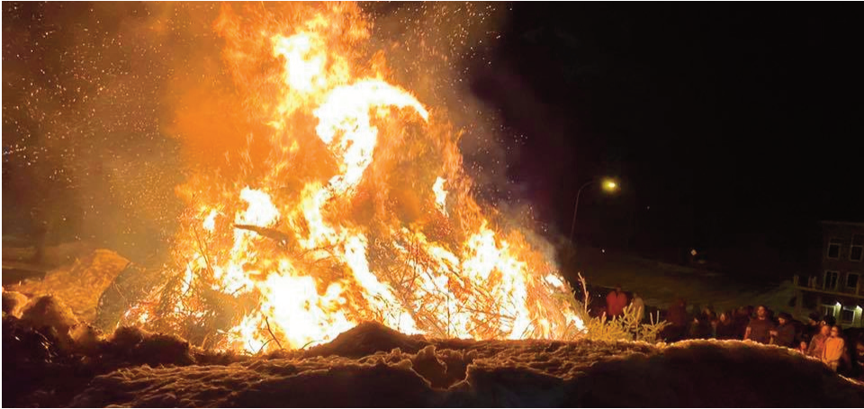
Winterfest bonfire of Christmas trees with the Lead Volunteer Fire Dept.